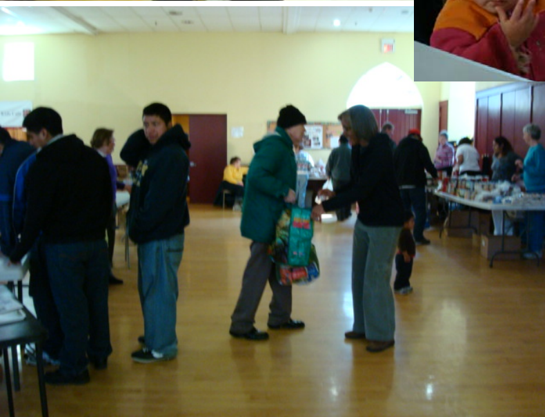
Photos taken during Brown Bag Lunch